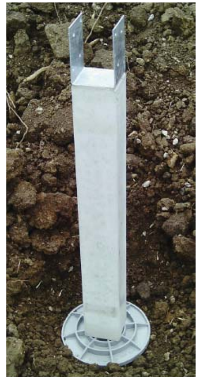
Figure 9.1: Deck Post on AG-CO Molded Plastic FootingPad

As in the case with concrete footings, the bottom of the molded plastic FootingPad shall be located below the frost depth line as determined by the local authorities.