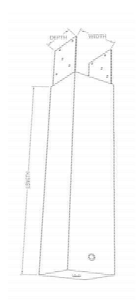
FIGURE 1—PERMA-COLUMN DECK POST